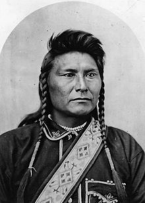
Chief Joseph, Lincoln Hall Speech, Washington DC (14 January 1879)

“Whenever the white man treats the Indian as they treat each other then we shall have no more wars. We shall be all alike – brothers of one father and mother, with one sky above us and one country around us and one government for all. Then the Great Spirit Chief who rules above will smile upon this land and send rain to wash out the bloody spots made by brothers' hands upon the face of the earth. For this time the Indian race is waiting and praying. I hope no more groans of wounded men and women will ever go to the ear of the Great Spirit Chief above, and that all people may be one people.”